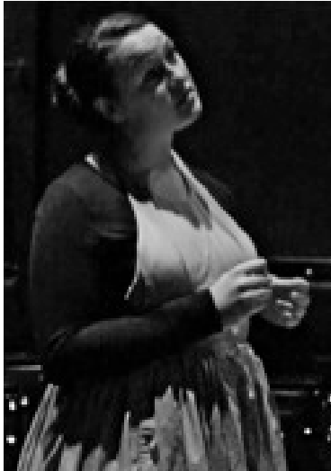
Fig. 3. Actor Katie Norcross in the character's comportment.