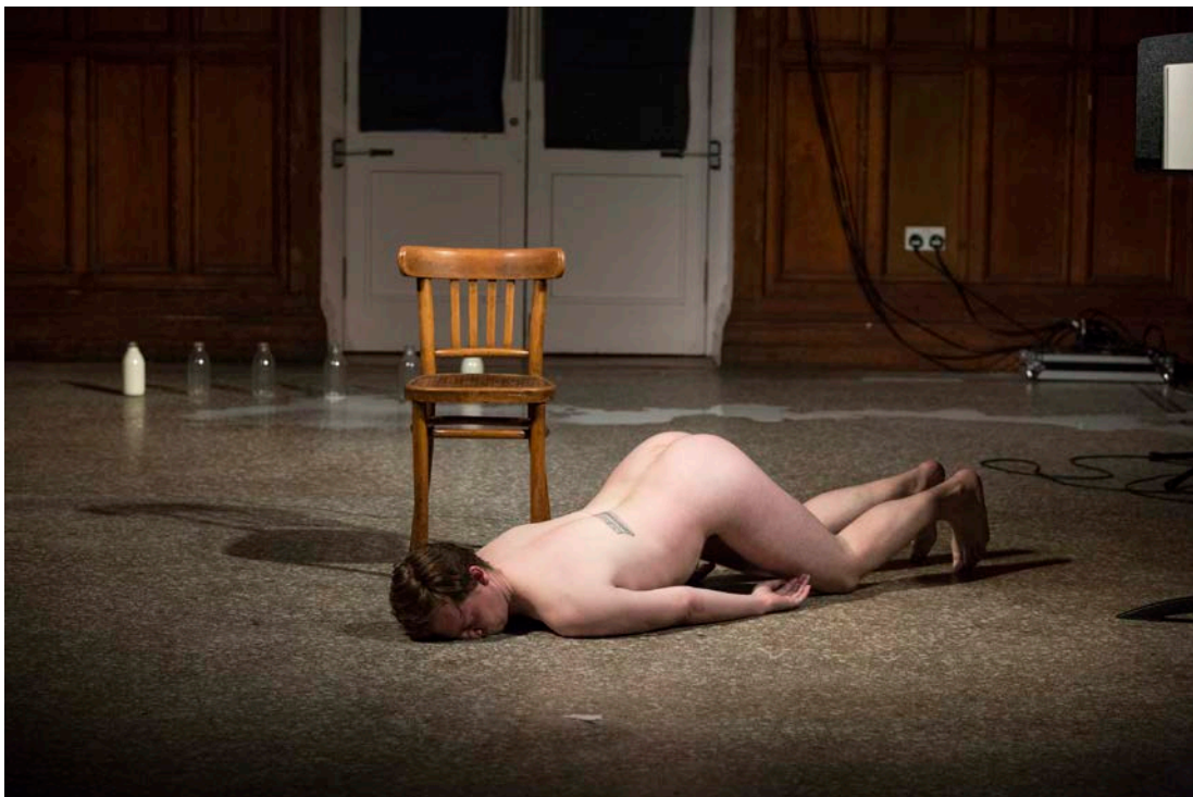
Figure 8: 'references to vulnerable/desirable/abstract/tortured/male/female bodies...'