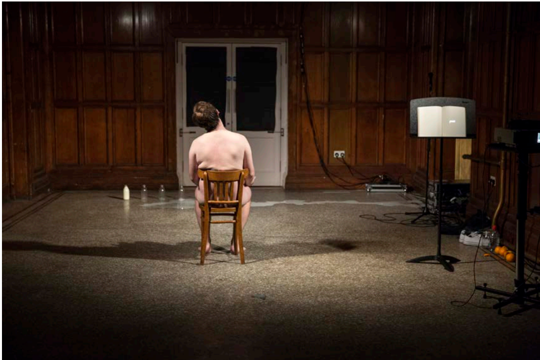
Figure 7: 'I turned the chair to the back of the space and delivered the sequence of poses facing away from the audience...'