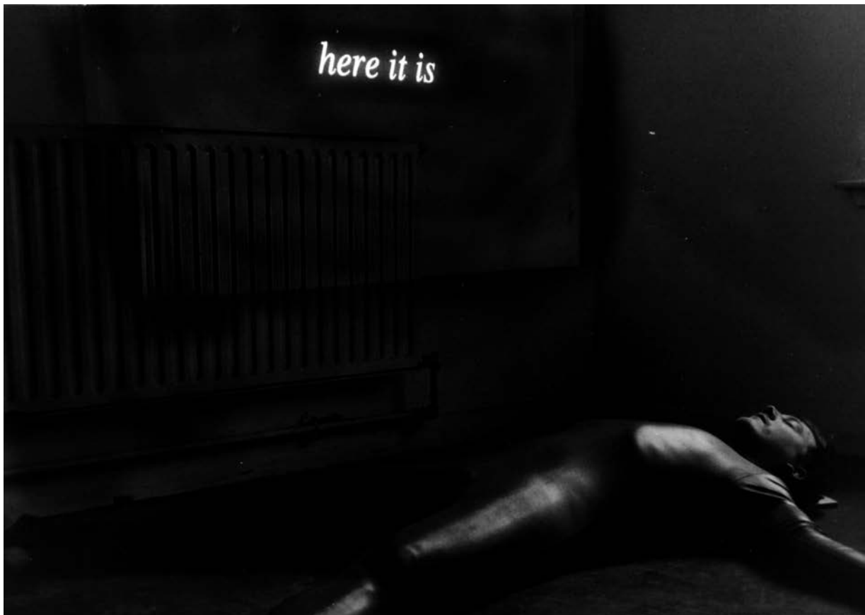
Figure 4: 'he transforms himself in advance into an image...'