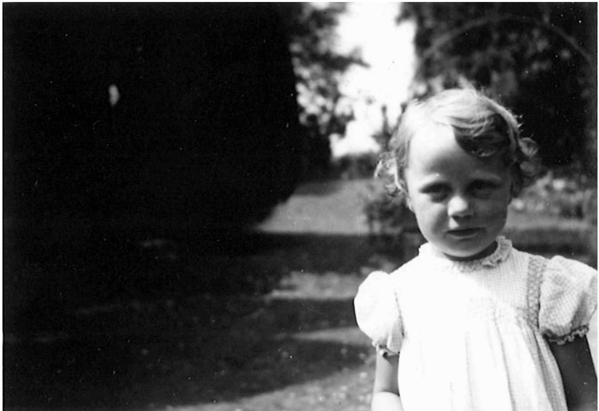
Figure 5: 'I fill the space left by the Winter Garden Photograph with an image of my own mother as a child...'