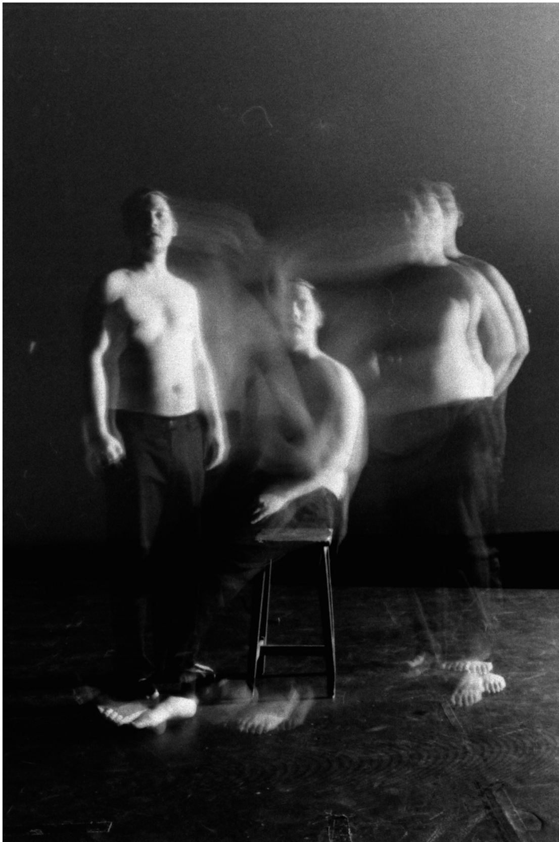
Figure 3: 'the portrait's inherent theatricality...'