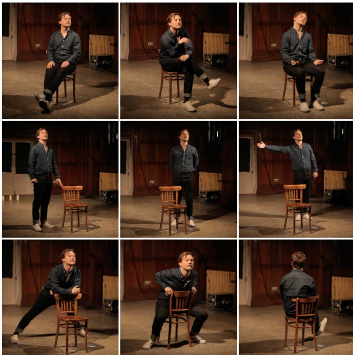
Figure 6: 'the still-act does not entail rigidity or morbidity it requires a performance of suspension...'