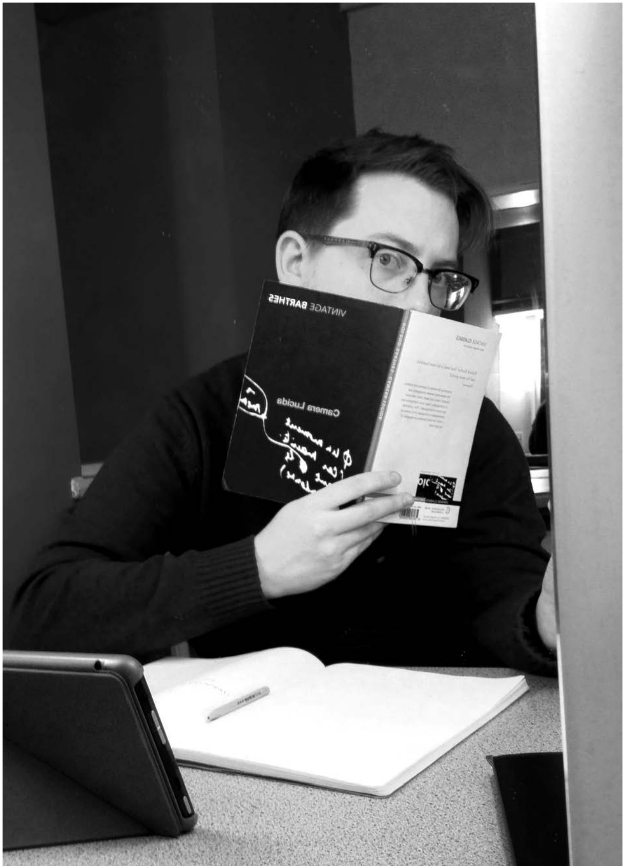
Figure 2: 'posing with Camera Lucida...'