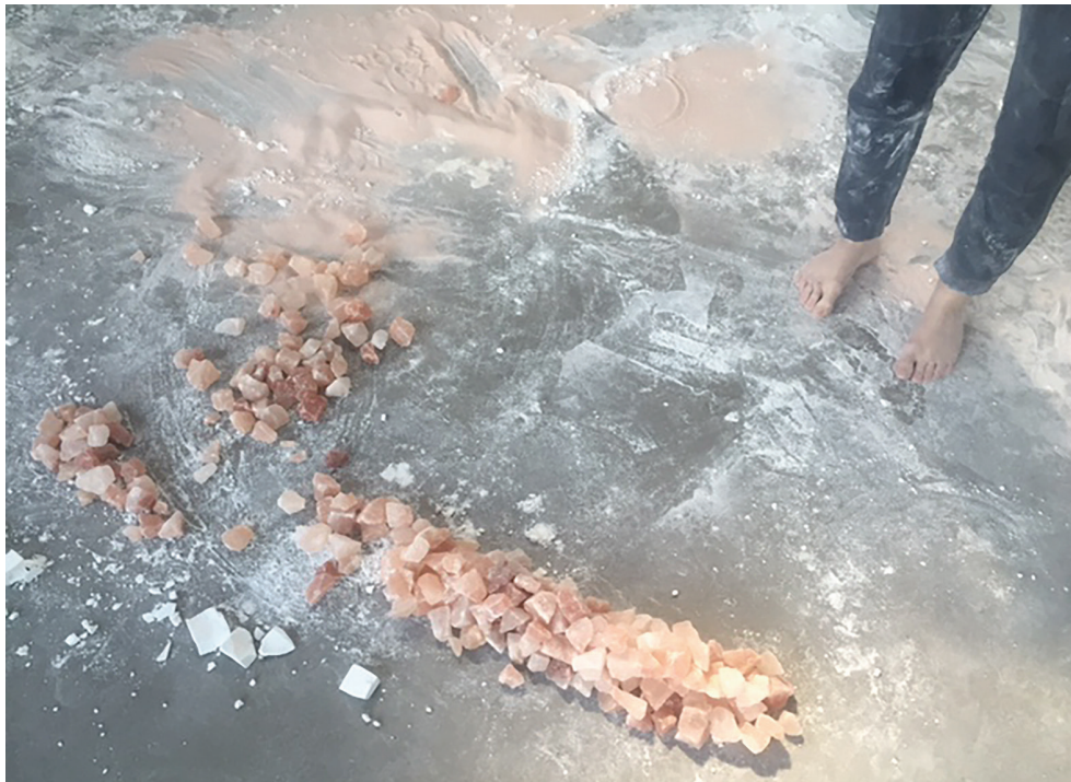
Image 12: Despina Zacharopoulou, Aftercare I, 3-day (20 hours) long durational performance, RCA Fine Art Research Exhibition: MATTER, Royal College of Art, 2016.

If z stands for step 1 within a morphogenetic process, and z^2 stands for the repetition of step 1, then step 2 not only contains the repetition of z , but also a sort of excess or residue c , which stands for the very morphogenetic process itself during the realization of the passage from step 1 to step